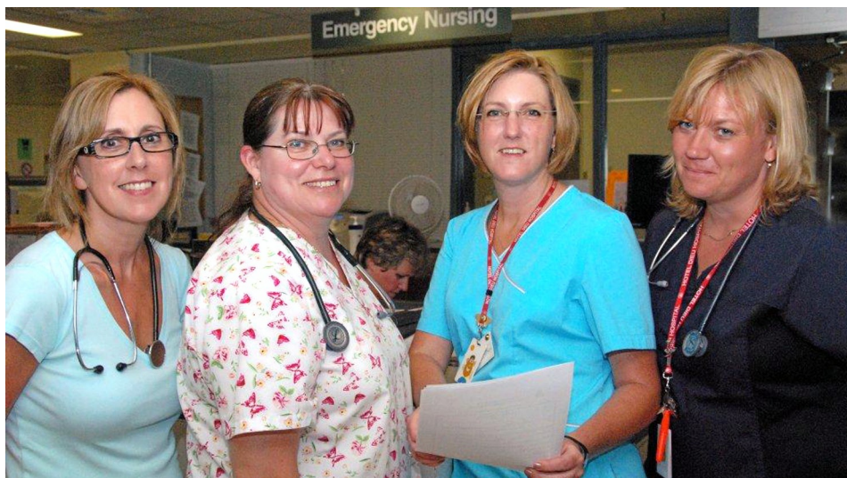
Hospital registered nurses hope for health care resources to be spent wisely in 2012.