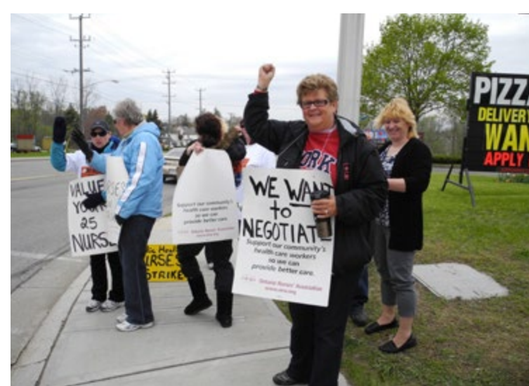
Fighting for that day off began a Lifetime of activism