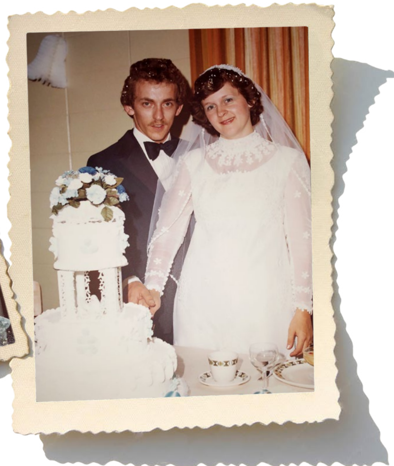
And it all started with her wedding day